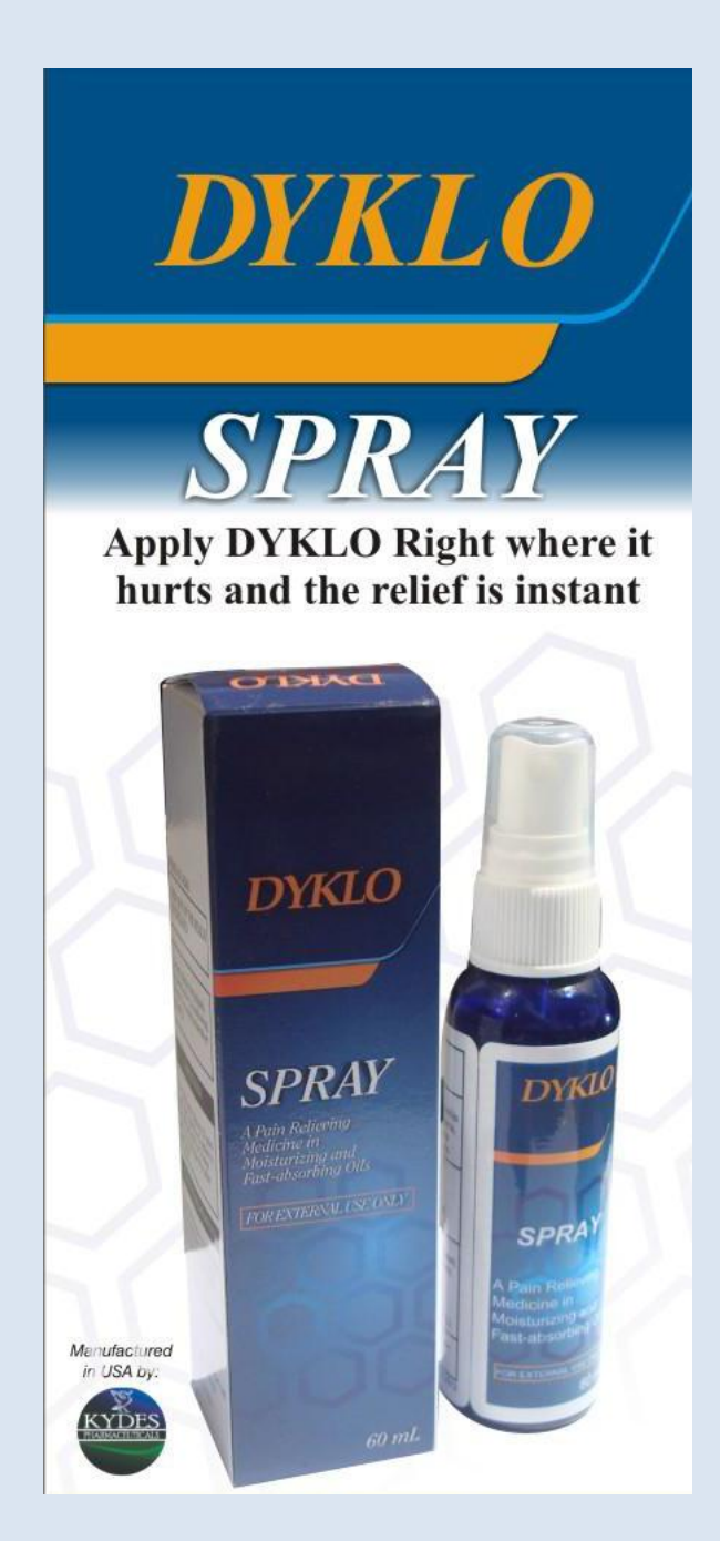
Apply Pain Medicine Right Where it Hurts for Quick and Sustained Relief